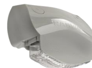
NARVA LED NUMBER PLATE LIGHTS