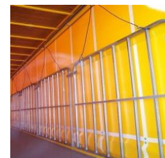
GATES RESTRAINT SYSTEM