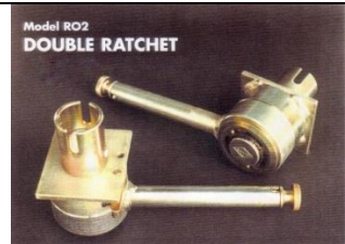
Model RO2 DOUBLE RATCHET