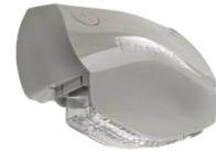
NARVA LED NUMBER PLATE LIGHTS